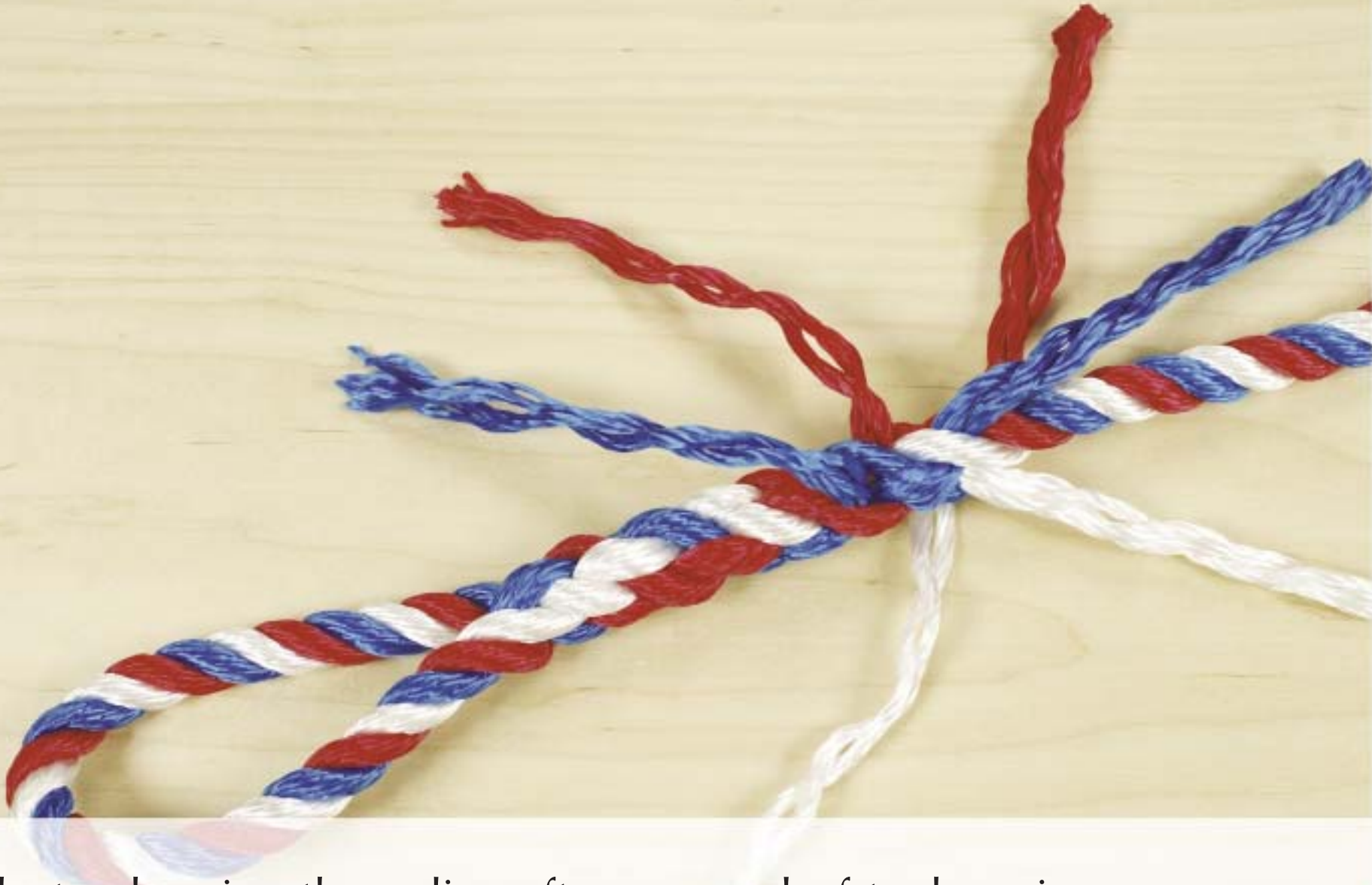
Photo showing the splice after a round of tucks using the reduced size strands.