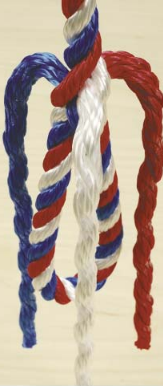
Photo showing the splice after the first round of tucks. The three strands should be level after each round.