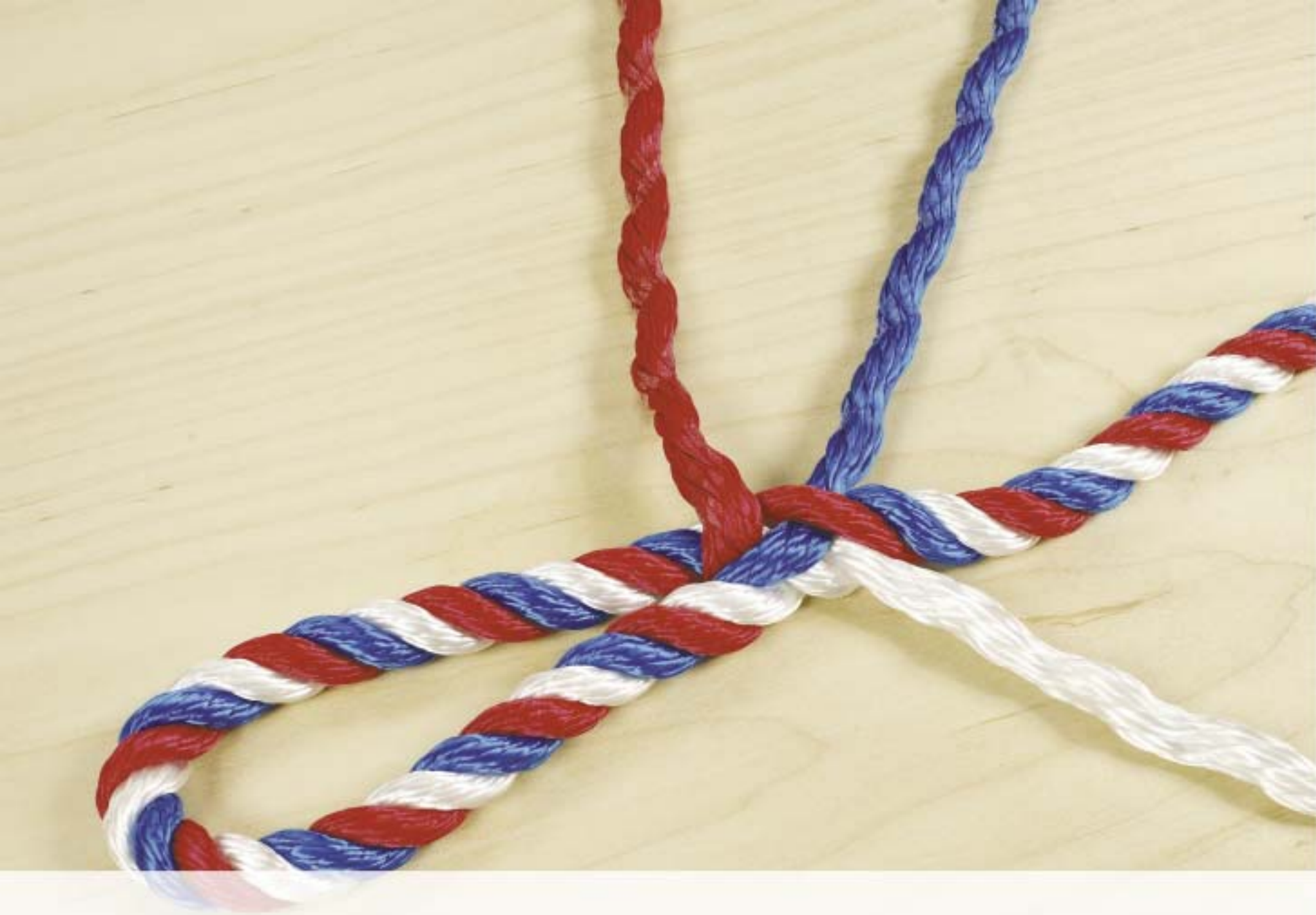
Photo showing the second strand pulled through.