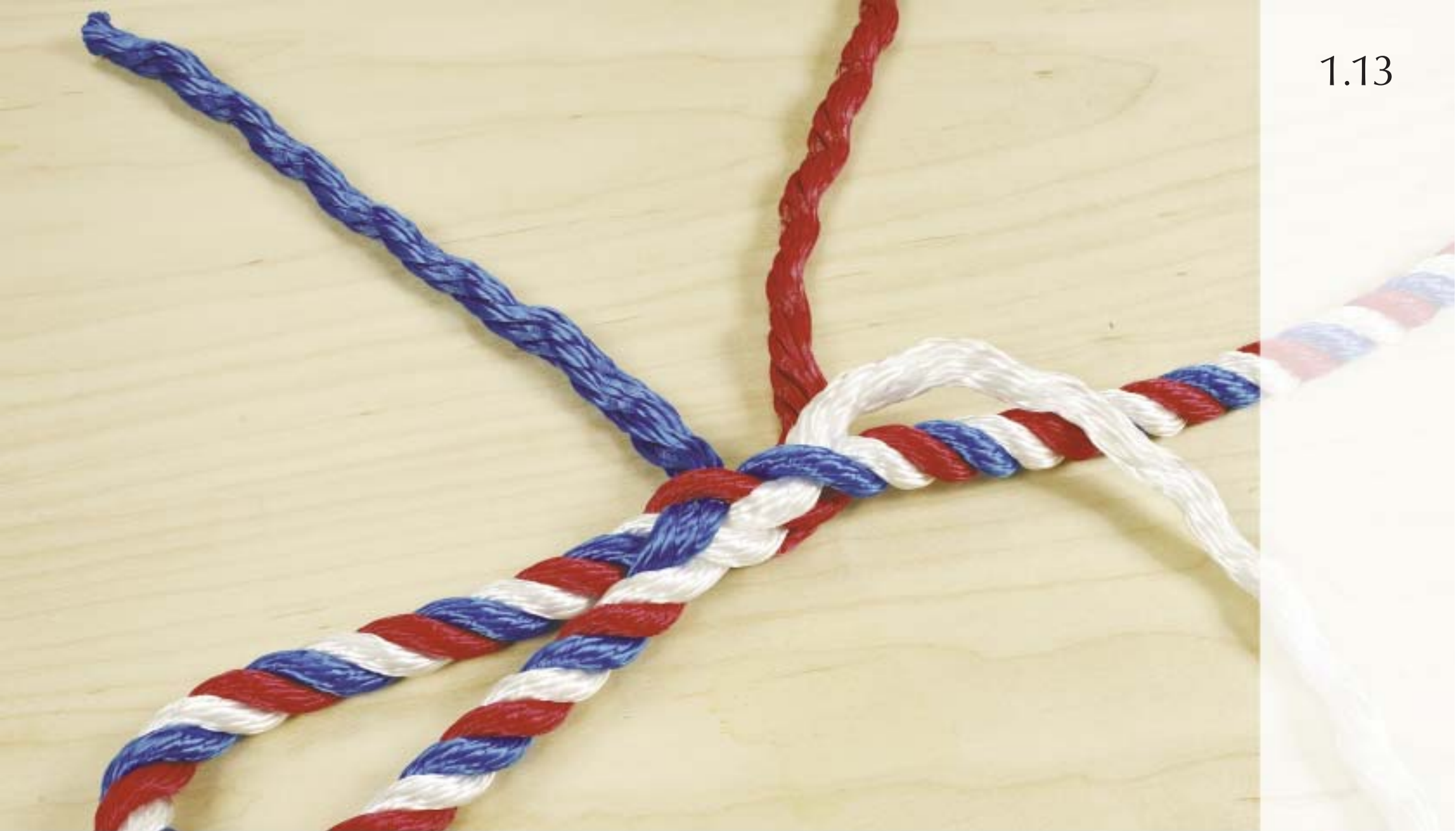
Photo showing the first strand having been pulled through for the second time.