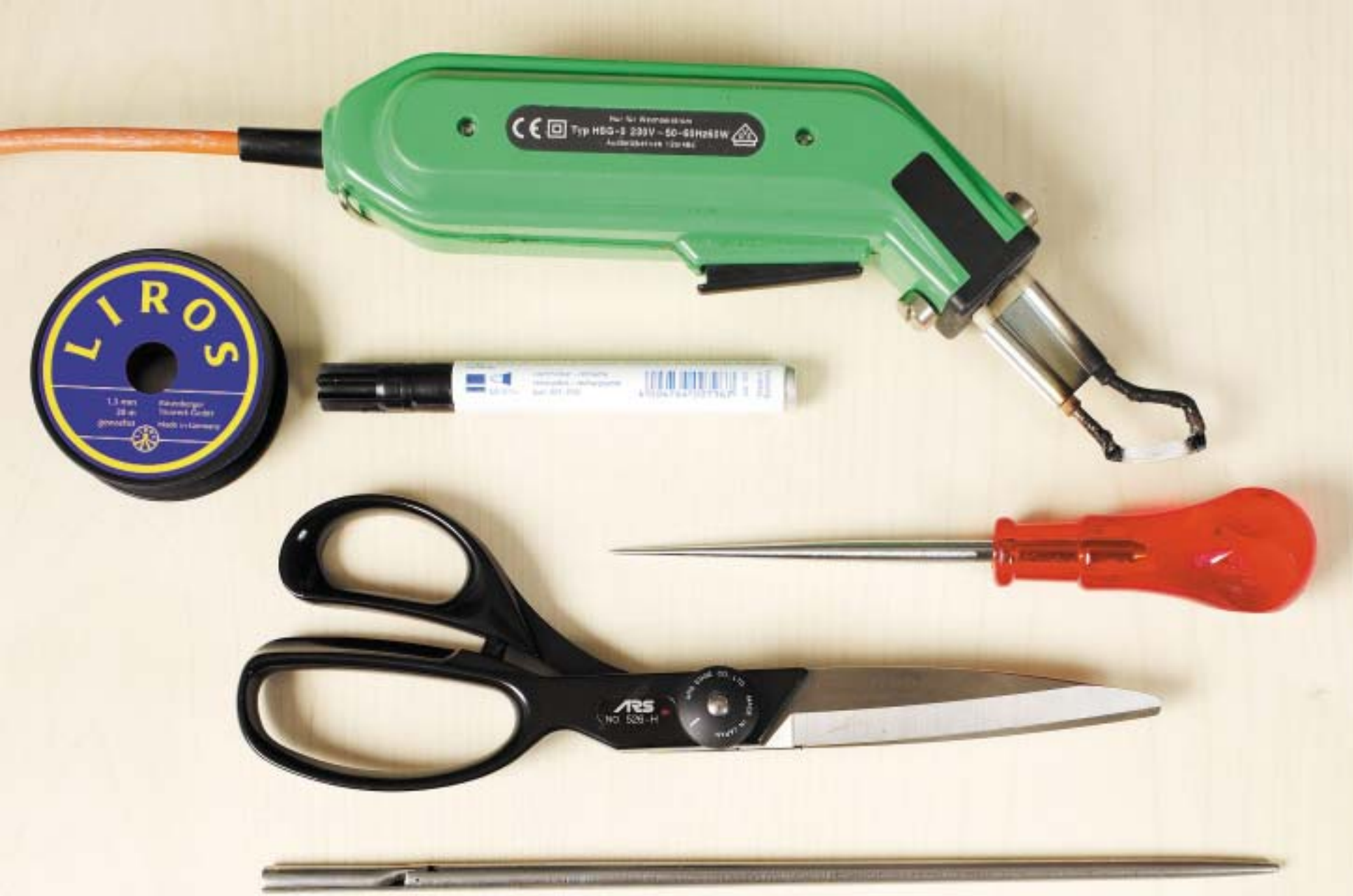
Tools needed for an endless splice.